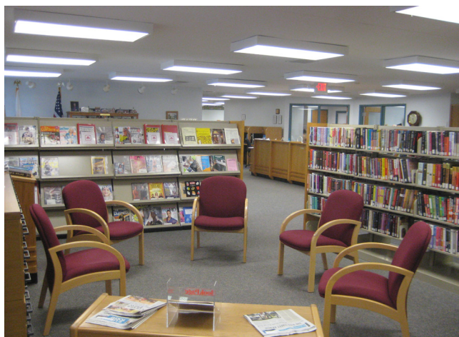
Carmi Public Library, Carmi, Illinois